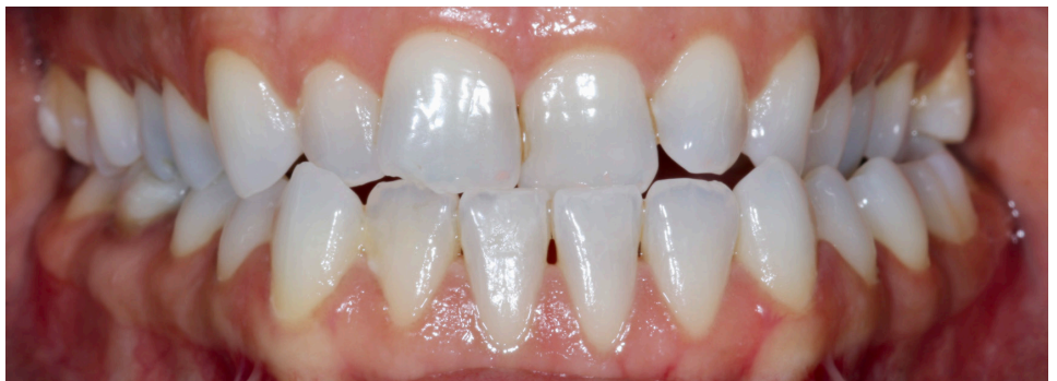
Figure 3: She was interested in aligning her teeth