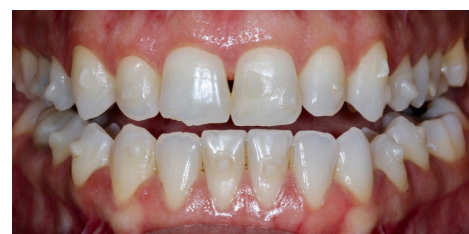
Figures 9 and 10: Composite attachments were temporarily placed on 11 upper and seven lower teeth

The 3D animation shows the predicted results during and after Invisalign treatment, including the position of composite attachments and the amount of interproximal reduction (IPR) required (Figures 7 and 8).