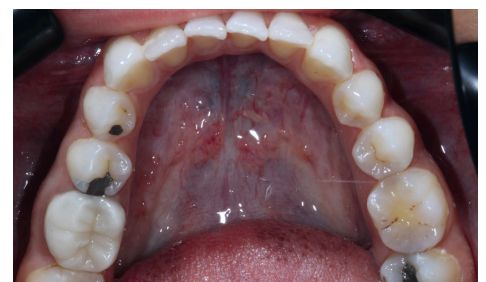
Figures 4 and 5: She was keen to replace some existing amalgam restorations