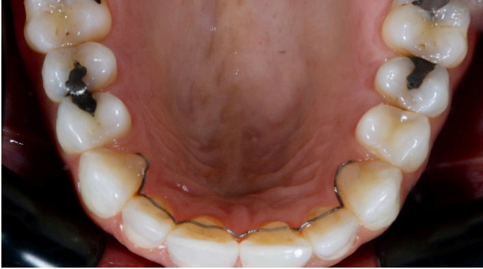
Figure 14: Fixed lingual stainless steel wire retainers were bonded using Kulzer Venus Diamond Flow to prevent tooth relapse