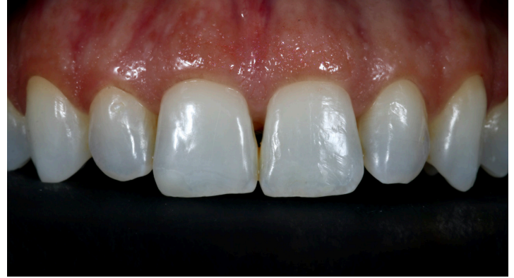
Figure 15: Composite edge-bonding was carried out on the UR1 using Venus Pearl A1 shade