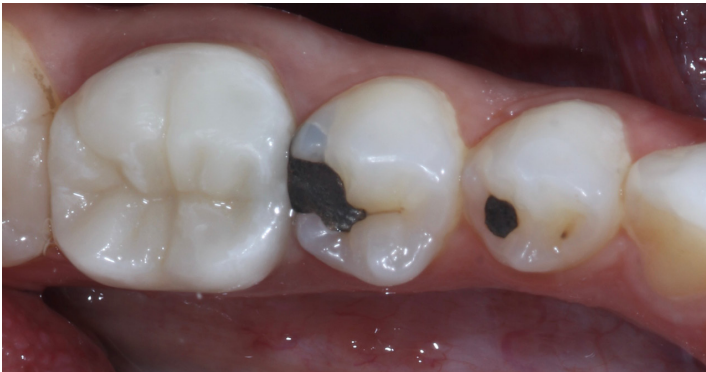
Figures 16-17: The LR5 and LR4 were restored using Venus Pearl One