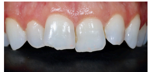
Figures 1 and 2: The patient was concerned about a chipped front tooth