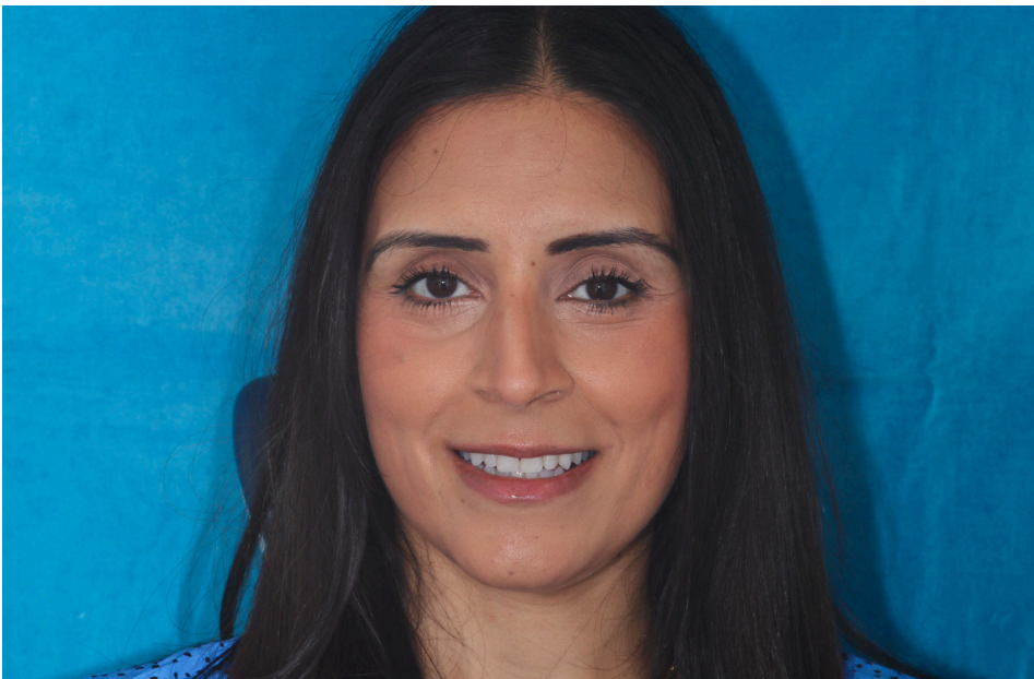
Figure 20: The patient was 'elated' with the result

polishing kit, which creates a long-lasting, glossy shine in just two working steps, with minimal material abrasion.