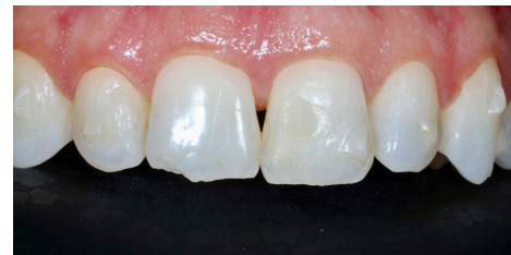
Figure 11: The anchors were placed to provide additional leverage points to assist tooth movement

The margins were bevelled, and the tooth was etched with 37% phosphoric acid etch gel and bonded with Kulzer Ibond Universal using a selective etch technique. Ibond is easy to apply and does not cause sensitivity.