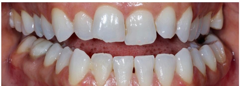
Figure 6: A class III incisor relationship and a molar class III and canine class III on both sides were identified