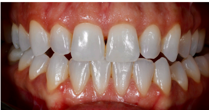
Figures 18-19: A successful aesthetic outcome was achieved using the minimally invasive approach of align, bleach and bond