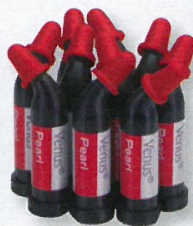
Available in PLT's or syringes

"The handling properties and simplicity of Venus Pearl remain unmatched in my hands. This is why I use it for the vast majority of my direct restorative procedures"