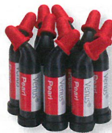
Available in PLT's or syringes

"The handling properties and simplicity of Venus Pearl remain unmatched in my hands. This is why I use it for the vast majority of my direct restorative procedures"