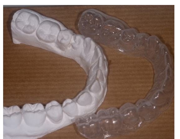
Figure 4: After casting a model from the impression, a transparent stent of the diagnostics was fabricated

The patient was adamant that he didn't want orthodontic intervention and wanted to avoid invasive dental work, so he chose to have the lower primary second molars built up with composite.