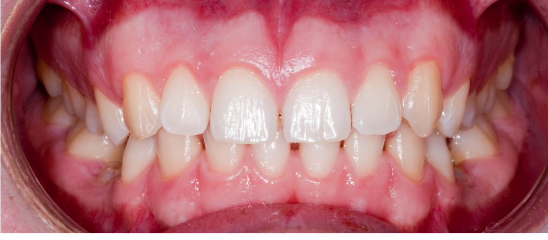
Figure 1: A 17-year-old male patient presented with submerged lower primary second molars

Until he was ready to have definitive treatment, a temporary denture could be considered, or the teeth built up with composite, to maintain the spaces.