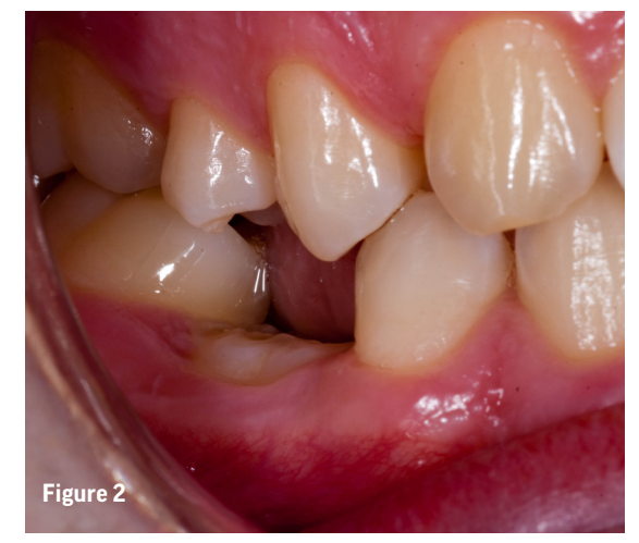
Figures 2 and 3: The teeth were out of occlusion, sitting low in centric